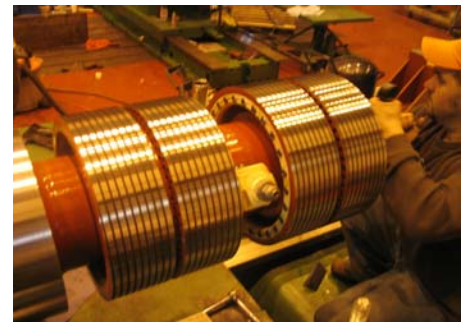
GMS Collector Ring Assemblies

(9) Rental Collector Ring Assemblies Available for Operation with Mobile DC Power Supply.