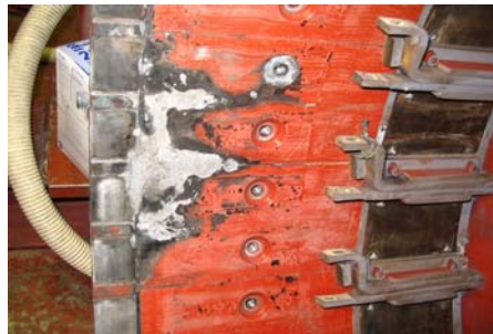
Example of Diode Wheel Damage Resulting in Forced Outage

In many cases, operational problems can be directly traced to contamination of diode wheel components. This condition, which can be addressed by cleaning and by a straightforward modification to the exciter housing, can lead to serious damage that can cause a forced outage.