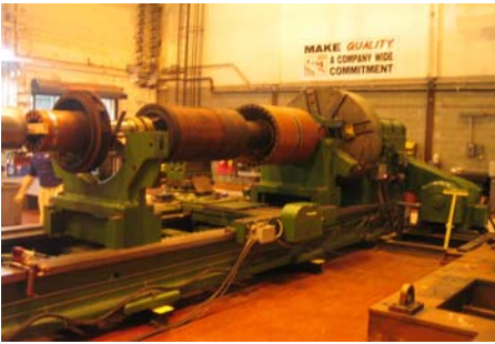
Recording of Total Indicated Runouts During Incoming Inspection