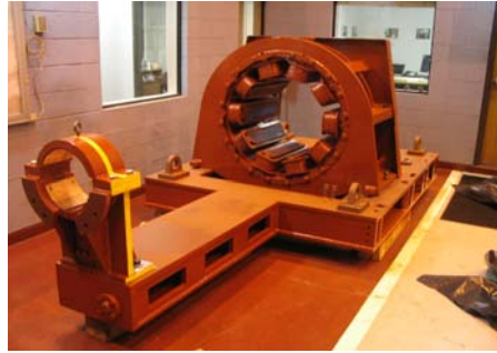
Exciter Base, Bearing and Pedestal Modification

(5) Overhauling of the Exciter Base and Refurbishment of Stationary Parts to Improve Vibration Performance