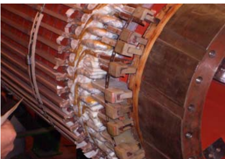
AC Armature during Rewind

(3) Rewinding of the AC Armature and DC Field