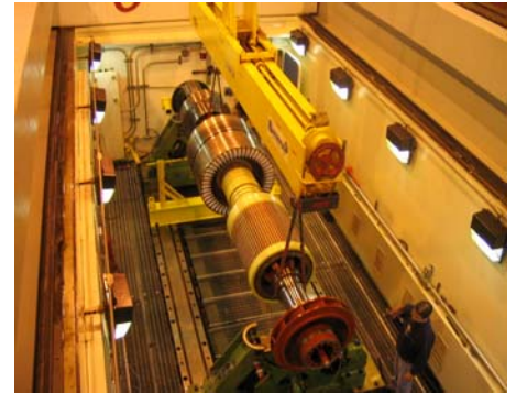
Exciter Rotor During Balancing

(2) Disassembly, Cleaning and Change Out of Diode Wheel Components, up to and including replacement of the Diode Wheel