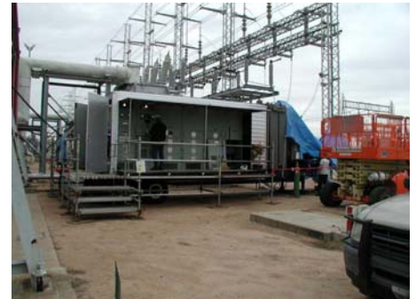
Mobile 6000A DC Power Supply

(8) Rental 6000A Power Supply for Continued Operation during Outage for Exciter Replacement or Repair.