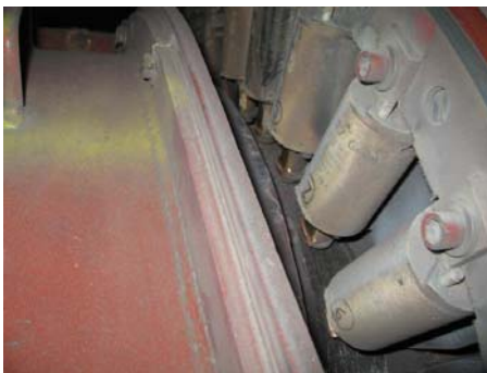
Diode Wheel Component Contamination Results in Reduced System Reliability

Brushless exciters are very reliable components if they are maintained in a proper way. But extended time between routine outages and a general lack of scheduled brushless exciter maintenance have caused instances of severe exciter damage resulting in forced power plant outages.