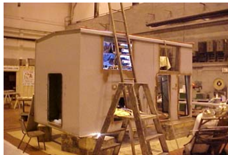
Positive Pressure Housing Modification

(6) Modification of the Exciter House to Provide Positive Internal Pressure and Reduce Dirt Contamination