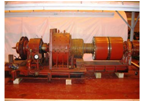
GMS Swap-Out Exciter

Also, GMS maintains an extensive inventory of exciter spare parts including bearing pedestals, diode wheel forgings, PMG assemblies, standard copper leads as well as assorted electrical components (diodes, fuses and capacitors). Swap-out exciters or mobile DC power supplies are also available to customers for use during refurbishment operations.